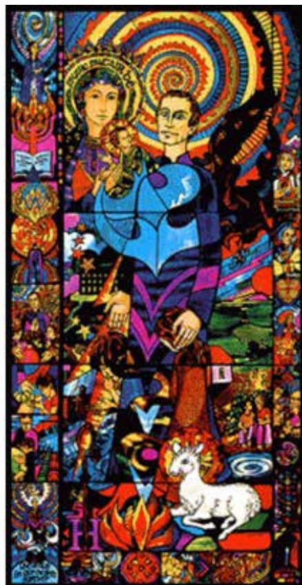
Edmund Rice Icon

Once you have completed your mandatory hours you can ask your Pastoral Teacher for a blue Advanced Social Justice Booklet.