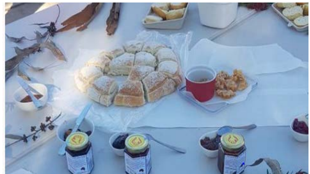
NAIDOC morning tea