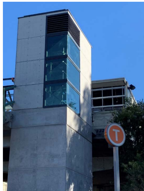
Park Avenue lift structure with new glass panels